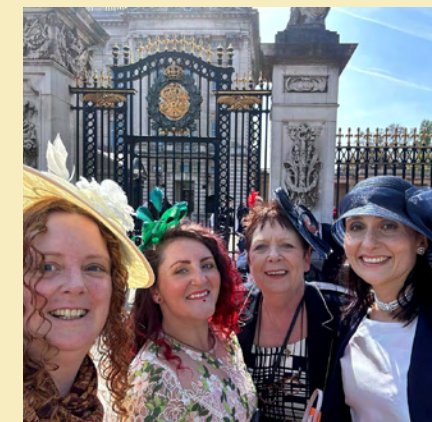
RABI team at Buckingham Palace