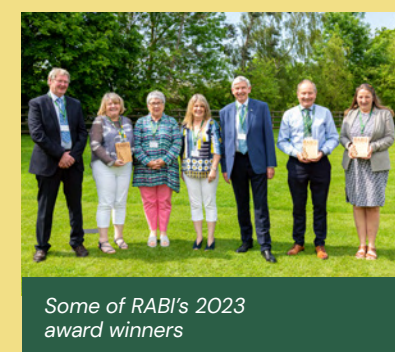
Some of RABI's 2023 award winners