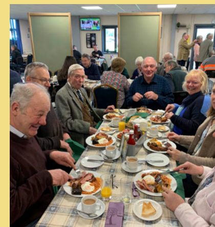
Attendees at the Thirsk auction mart breakfast

Finally, we'd like to remember two very dear volunteers from our North East committees. We miss and remember them very fondly, and their loss has underlined how important each of our volunteers are – thank you.