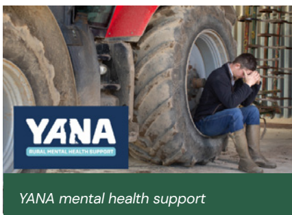
YANA mental health support

"Any further calls to YANA's helpline made from Worcestershire will be redirected, if appropriate and with the caller's permission, to RABI," she said.