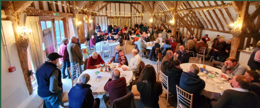
West Sussex Farmhouse Breakfast in Fitzleroi Barn, Pulborough

farmhouse breakfasts, one in a beautifully restored barn on Fitzleroi Farm. These events are an excellent way of bringing the farming community together.