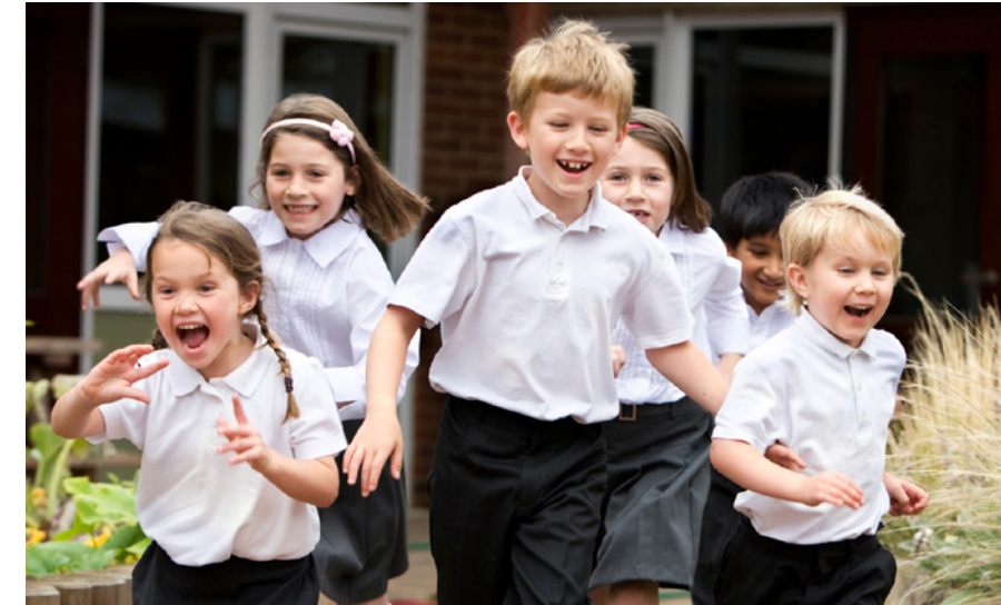
Thousands of farming families will benefit from Return to School funding

Following the success of RABI's Return to School campaign in 2022 and a continuing need for support, confirmed by on the ground sector-wide research, RABI has launched a further Return to School campaign aimed at reaching more families in need.