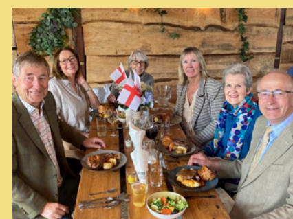
Co Durham GBBW lunch