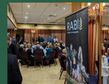
Devon Dinner and Auction