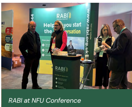
RABI at NFU Conference

"We need to maximise on opportunities where we can speak directly to farming people," she says.