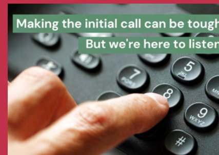
Making the initial call can be tough. But we're here to listen.

or Call the 24/7 confidential helpline: 0800 188 4444