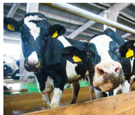
Bovine TB can be devastating