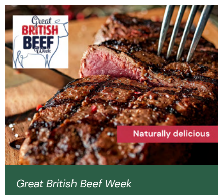
Great British Beef Week

RABI proudly supported this fantastic initiative with a series of fundraising dinners. Read more about #GBBW2023 events on our regional news pages.