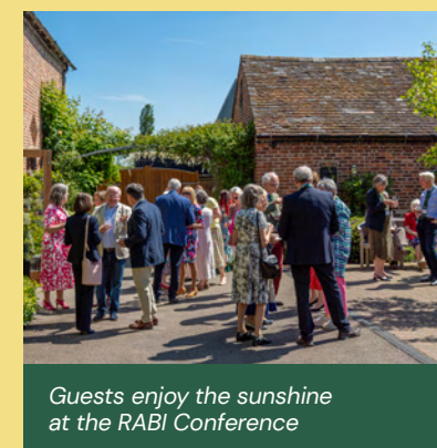
Guests enjoy the sunshine at the RABI Conference