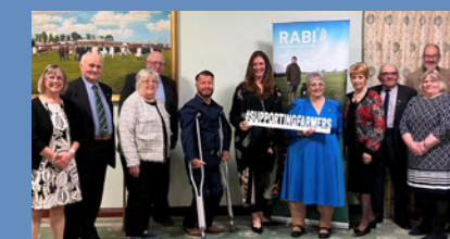
Staffordshire Dinner committee