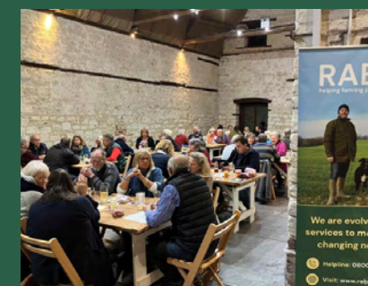
Dorset quiz night