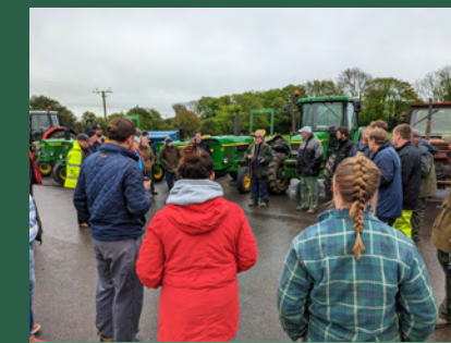
Cornwall tractor run

been an official show charity at the amazing Royal Cornwall Show this year. The show is always a hotly anticipated date in the South West's calendars and it was great to engage with so many members of the farming community. Special thanks to event organisers RACC for their support.